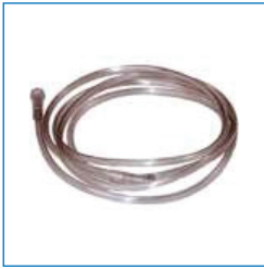
The air hose