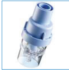
The medicine cup