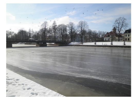
"Winter in town", by David J, is licensed under CC BY 2.0

A: Author (Creator,- full name where possible. A linked social media handle is acceptable in cases where the full name isn't available) S: Source (URL where the image is available—this can be a hyperlink in the title) L: Licence (what licence is used, e.g. CC BY)