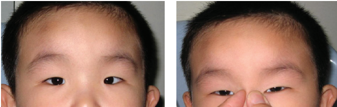
Pseudoesotropia caused by a broad nose bridge

In some cases, depending on face shape, ethnicity, or genetic conditions, this appearance may last into adulthood—but it will not affect eye health.