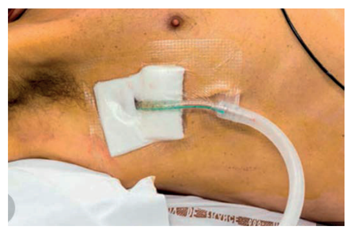
Traumatic chest drain insertion site

We use a stitch to tie the drain in and an adhesive dressing on the skin to make it as secure as possible. We may also attach the tube to your side with some tape to allow some slack as you move. However, please move carefully.