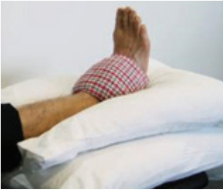
Location of a metatarsal fracture