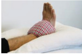
Location of a metatarsal fracture