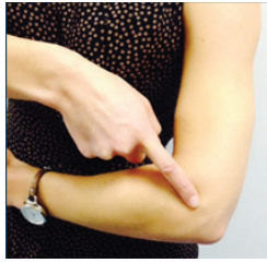
Location of elbow dislocation