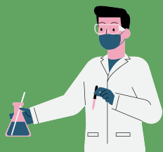
Industry (manufacturing medicines)