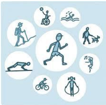
Physical Activity 20-30 minutes daily